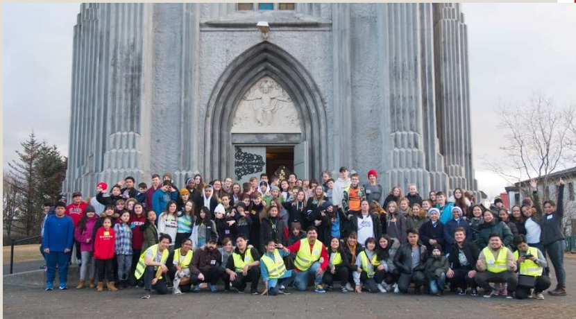
The Youth day of the Diocese of Reykjavik

• Organizing of World Youth of the Diocese of Reykjavik. 120 participants, including our volunteers and the team, spend two days in Landakot school in the Parish of Christ the King in Reykjavik. Through educational, spiritual content and play we were growing in our faith and mutual relations. This was also a promotional event for the World Youth Day in Panama in January 2019. On the following link is the video report from the event: