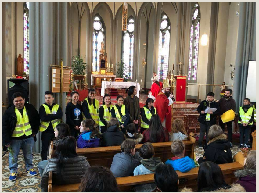
Closing ceremony of the Youth Day. The Bishop thanks volunteers for their contribution.

• World Youth Day in Panama 2019 – organizing promotion, applications and the trip to Panama.